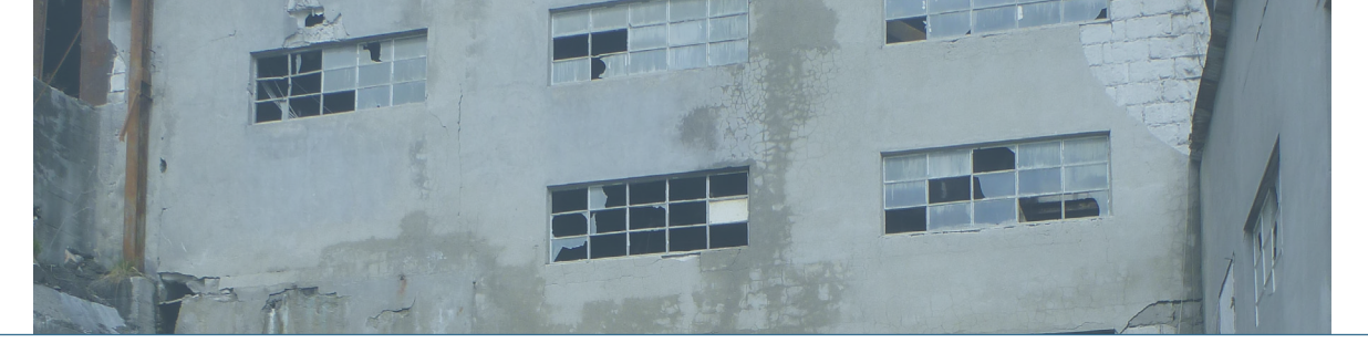
Strålevern Rapport • 2013:6