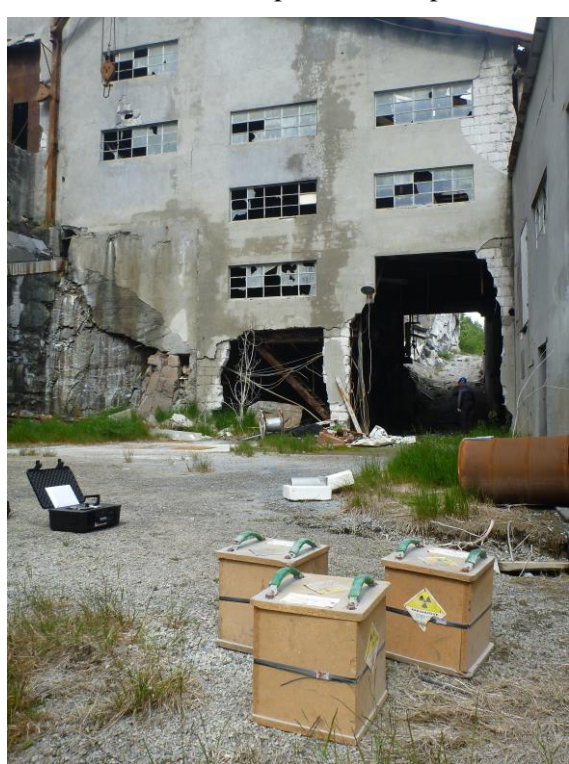
Industrial gauges discovered at an abandon mine in the north-western part of Norway in June 2013. The mine shut down almost thirty years ago and the buildings are in poor condition.

If an orphan source is found, the normal procedure is that the NRPA attempts to find the owner, order a secure and safe management of the orphaned source regardless of costs, and, if relevant, to search until they find other orphaned sources. It is standard procedure to publish a short summery of the incident on the NRPAs web-page. If relevant, the case will also be reported to the police.