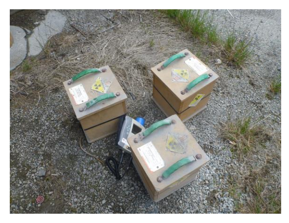
Only three of five discovered boxes included gauges, and two of totally seven boxes in the original shipment where missing.

In Norway there are approximately three to five incidents every year of this kind. The orphan sources are often old industrial gauges taken out of use several years ago. In June 2013 the NRPA handled a situation where several boxes with Co-60 sources accidentally were discovered in buildings belonging to an abandoned mine. The buildings are in poor condition and are almost falling to pieces.