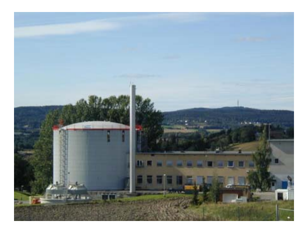
JEEP II at Kjeller.

The Norwegian nuclear activities were started in 1948 by the establishment of Institutt for Atomenergi (Institute for Atomic Energy, at present Institute for Energy Technology) at Kjeller north-east of Oslo. The first research reactor JEEP I, reached criticality in July 1951. It was followed by the Halden Boiling Heavy Water Reactor in Halden in 1959 (the OECD Halden Reactor Project). The NORA reactor was built at Kjeller in 1961. It was shut down in 1968 and later decommissioned, the same had happened to JEEP I in 1967. JEEP II was built in 1965-66 and reached criticality in December 1966. At present, the JEEP II at Kjeller and the HBWR in Halden are in operation. JEEP II has a thermal capacity of 2 MW. HBWR has a thermal capacity of 25 MW, but it is usually operated at less than 20 MW. Both reactors are owned and operated by the Institute for Energy Technology.