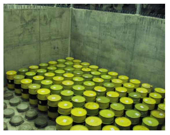
The Combined Storage and Repository for Low and Medium Level Radioactive Waste in Himdalen.

The Institute for Energy Technology is responsible for handling, storage and final disposal of radioactive waste excluding NORM, and for that purpose, the institute also operates the Combined Storage and Repository for Low and Medium Level Radioactive Waste in Himdalen 25 km south-east of Kjeller. The capacity is about 10 000 barrels of waste, and it is expected to be filled around 2030. The strategy for storage and final disposal of spent nuclear fuel is under planning and an official committee issued a report on possible December strategies in 2001. The recommendations in this report have been assessed by a working group to establish technical specifications for a storage facility for spent fuel and intermediate level long-lived waste. The establishment of a new group which among other issues will give recommendations on siting and technical solutions for a new storage facility for spent nuclear fuel and long lived intermediate level waste is under consideration on the ministerial level. Further details of the waste management system are reported under the Joint Convention on the Safety of Spent Fuel Management and on the Safety of Radioactive Waste Management.