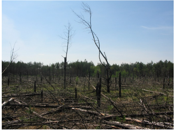
Forest fire damage on contaminated lands of the PSRER.