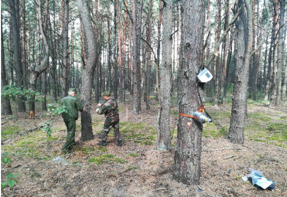
Joint DSA – PSRER field work in developing field methods for assaying trees for contaminants.

The area of Belarus with the most forest coverage is the Gomel region and some 2 million ha (21 % of the forest fund area) continues to be impacted by contamination derived from Chernobyl. Wood harvesting is prohibited in areas with contamination densities in excess of 1.4 MBq m<sup>2</sup>.