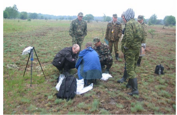
Joint DSA-PSRER operations during NATO field work

Although numerous studies had been conducted within the Chernobyl exclusion zone in the years following the accident, significant uncertainties existed in maps of radionuclide distributions within the territory of PSRER, imposing difficulties in forecasting the future contamination situation. Plans were made to substantially improve current maps to assist in the planning of scientific, experimental, economic and social activity in the PSRER and to allow radiological assessments to be performed appropriately. The project was funded by the NATO Science for Peace program (Contract NATO SfP N 983057) and commenced in 2008 with the final report being delivered in 2011. Seven organizations from Norway, Belarus and Ukraine took part in the project.