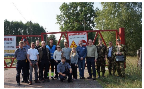
Nordic and Belarusian participants in the NKS funded GAMFAC project.

DSA coordinated two collaborative projects between the PSRER and relevant Nordic authorities in relation to emergency response during the period 2015 to 2016.