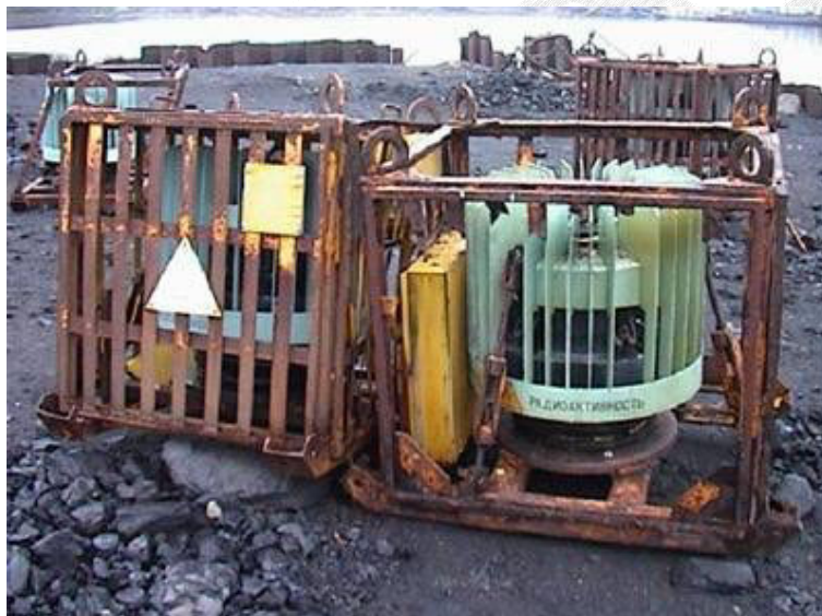
Retired RTGs awaiting decommissioning on the Kola Peninsula.

Decommissioning radioisotope thermoelectric generators (RTGs) in Northwest Russia is a priority area under the Norwegian Ministry of Foreign Affairs Nuclear Action Plan. This NRPA Bulletin presents findings from a newly published NRPA Report that reviews environmental impact assessment (EIA) work undertaken as part of the joint Norwegian-Russian project to decommission RTGs in Northwest Russia.