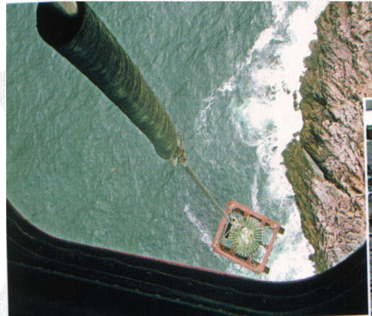
An RTG under helicopter transportation

elevated levels of radionuclides in the environment or pose a threat to humans.