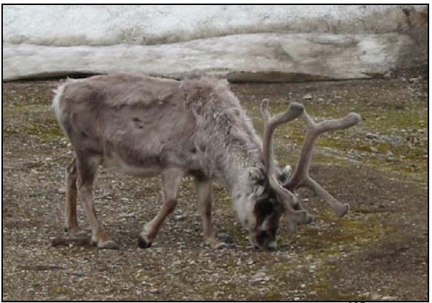
Svalbard reindeer show far lower levels of <sup>137</sup>Cs than species of Norwegian reindeer.