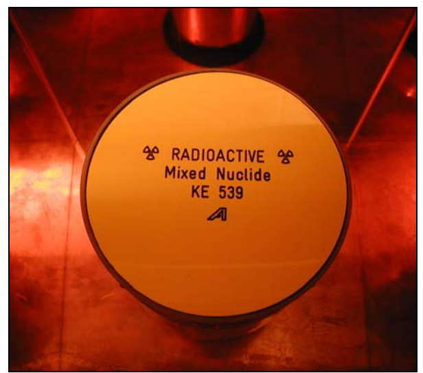
Gamma radiation analysis in the Environmental Unit's laboratory.