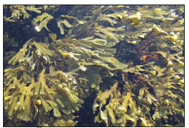
Levels of <sup>99</sup>Tc in seawater and seaweed samples from the Norwegian Arctic increased following discharges of this radionuclide from Sellafield.

In contrast, levels of ^{210} Po in Svalbard reindeer and Norwegian reindeer are much more similar than those observed for ^{137} Cs.