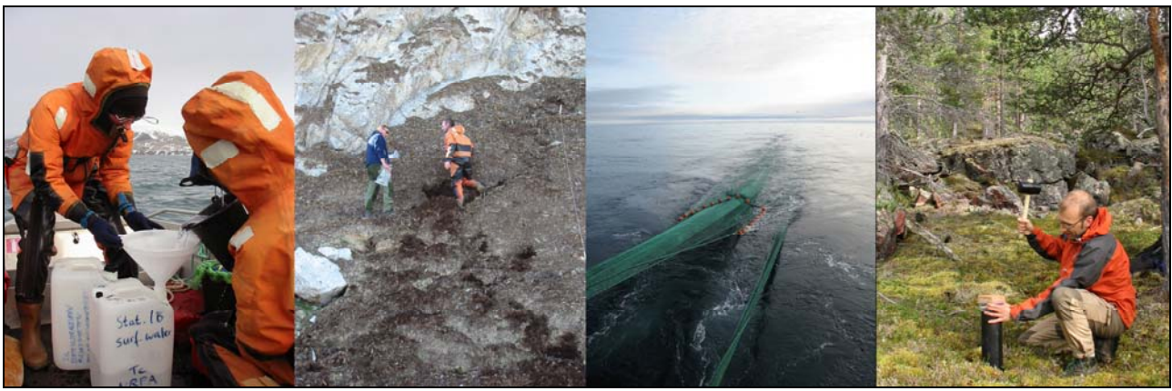
Examples of the activities carried out by the Environmental Unit in Tromsø. From left to right: Sampling sea water in Kongsfjord, Svalbard; Sampling below a seabird colony in Kongsfjord, Svalbard; Sampling for fish species in the Barents Sea; Soil core sampling in Øvre Dividalen, Troms.

The Norwegian Radiation Protection Authority (NRPA) established an Environmental Unit at the Polar Environmental Centre in Tromsø in the summer of 1999. The aim of establishing the unit in Tromsø was to further the monitoring programmes of the NRPA in the Arctic and to the promote collaboration within the Polar Environmental Centre. Over the last 10 years, the NRPA's Environmental Unit has undertaken a range of research and monitoring activities in close cooperation with other institutes in the Polar Environmental Centre that have helped to further understand the current radiological status of the Norwegian Arctic.