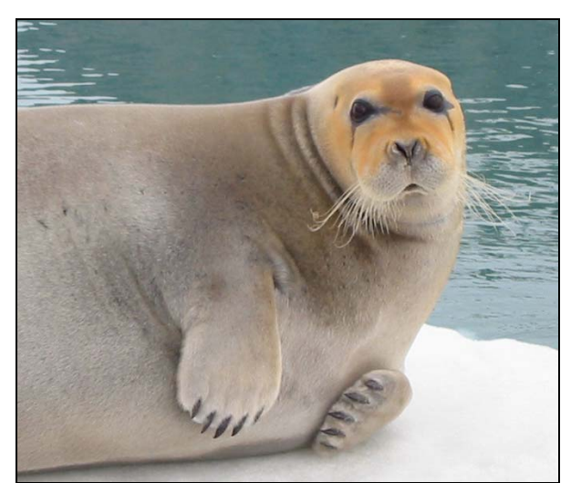
Levels of <sup>137</sup>Cs in seals suggest that this radionuclide is biomagnified through arctic marine food chains.

Levels of <sup>137</sup>Cs in arctic marine animal species are typically low or below the limits of detection. For marine mammal species, highest levels have been observed in polar bears. Although average values of <sup>137</sup>Cs in polar bears from Svalbard in the last decade were lower compared to values in animals from Svalbard in 1980, they were higher than those reported in polar bears from other Arctic regions in the 1990's. In seal species, levels of <sup>137</sup>Cs are typically higher than those of biota from lower trophic levels, suggesting that <sup>137</sup>Cs is biomagnified through arctic marine food chains. Initial investigations of the Greenland shark, a less well known and rarely studied Arctic predator, revealed lower levels of <sup>137</sup>Cs than in polar bears. Seabirds sampled in Svalbard show significant variations between species in levels of the naturally occurring radionuclide <sup>210</sup>Po that are probably linked to differences in diet.