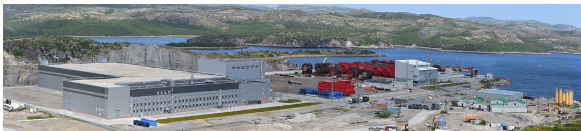
The Saida disposal Centre was handed over to the Russian side for operation in August 2015.