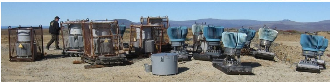
Recovered RTGs ready for transport

From 2005 the CEG was used as a forum for the exchange of information, planning, and carrying out projects for RTG decommissioning in Russia. Two workshops (in 2005 and 2008) were dedicated specifically to RTG issues. RTGs were part of other regional workshops where a special session was devoted to problems of RTG decommissioning. In 2006-2007 the Russian Kurchatov Institute, in coordination with Canada and other Russian agencies, created a Master Plan for the decommissioning of RTGs that included RTG accounting, temporary storage, transportation schemes, RTG disassembly facilities, long term storage of radioactive heat sources (RHS), regulatory issues, environmental impact assessments, as well as risk and cost analyses. In 2007, the completed Master Plan was presented at the CEG meeting to all member states. Consequently a comprehensive database was developed to track RTGs and APS replacements. In 2008 an Action Plan was developed for RTG decommissioning, which included all the above-mentioned phases. At each subsequent CEG plenary meeting reports on the status of RTG projects were presented. Members of the CEG created a working group (WG) specifically to address RTG-related questions, headed by Rosatom. All joint international projects were conducted by Russia. USA and Norway were the primary donor countries.