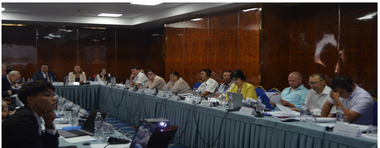
Picture 1. Stakeholders workshop in Bishkek, Kyrgyzstan, 2019

DSAs bilateral cooperation is financed through the Norwegian Governments Nuclear Action Plan, with allocation of funds from the Norwegian Ministry of Foreign Affairs. DSA has supported the completion of updated regulatory threat assessments in the field of radiation and nuclear safety and security by the regulatory bodies of Kazakhstan, Kyrgyzstan, and Tajikistan. A new “Roadmap” for future regulatory cooperation has been established for each country.