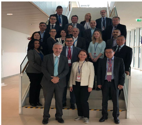
Picture 3. 4th meeting of the Steering Committee (SC) of the European and Central Asia Safety Network (EuCAS) was held in the IAEA 14-15 May 2019

The bilateral cooperation work described here, and the country specific Roadmaps are presented in detail in DSA Report, May 2021, number 1 (Picture 5). The results and future program are also discussed in a broad international context. It is anticipated that further opportunities for sharing of international experience will occur, extending beyond uranium related issues, such as the work of the recently set up NEA (Nuclear Energy Agency) Committee on Decommissioning and Legacy Management. Such activities are due to include conduct of international peer reviews and providing expert feedback to ensure that best practices in regulatory and technical methodologies are adopted in decommissioning and legacy management, which includes uranium legacy challenges. Given the need to manage and optimize limited regulatory resources, the work of the NEA Expert Group on development of a Holistic Process for Decision Making on Decommissioning and Management of Complex Sites will also be of significant interest.