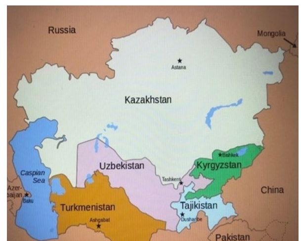
Map of Central Asia.

The bilateral cooperation between DSA and Central Asian (CA) countries entered its third phase in 2018 with an updated set of regulatory threat assessments (RTA2). Bearing in mind the progress already made and reported in NRPA reports 2011:5 and 2016:7, these assessments were designed to provide an updated view and more comprehensive understanding of the more significant remaining radiation safety and security issues that are most in need of regulatory development. Accordingly, the RTA2 covered seven main areas: organization and general principles of the regulatory body; safety of installations; transport of radioactive materials; radiation safety; emergency preparedness and response; radioactive waste management, including decommissioning and remediation; and radiation and nuclear security.